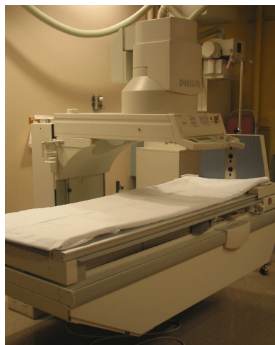
Bed and the camera

When it is your turn, a technologist will bring you and your parent to a room with a few big machines. These machines are just big cameras that take pictures of the inside of your body! There will be a bed; some people think it looks more like a table. The cameras are connected to a TV screen so that the doctor can see the pictures as they are being taken.