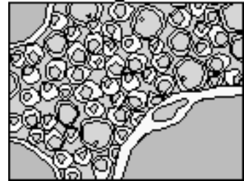
What bone marrow looks like under a microscope.

Bone marrow is inside the large bones of the body. It makes the blood cells. In a bone marrow aspiration a small sample of liquid bone marrow is taken from the body, to look at the blood cells. A nurse practitioner or doctor pushes a needle into the bone, usually a hip bone, and gently pulls a little bone marrow into the syringe. The bone marrow is red, and looks like blood.