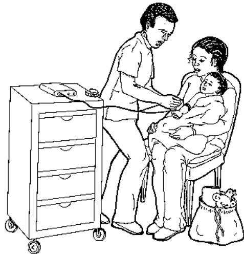
The lab technician will collect the sweat on a piece of filter paper.

Then two metal disks will be held against the skin for five minutes. The disks will be attached to wires that are connected to a small machine. When the machine is turned on, your child may feel a tingling, like you feel when your foot falls asleep. Some children describe a mild discomfort. In five minutes the machine will be turned off, and the disks will be taken off the skin.