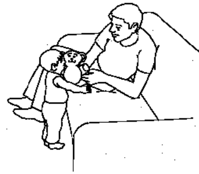
Help your child hold on to furniture and learn to balance.