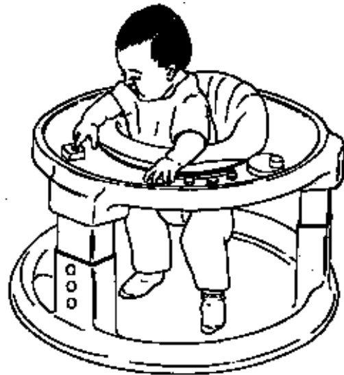
Baby walkers make learning how to walk take longer and they are not safe.