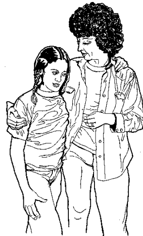
Teach your child how to solve problems, don't solve problems for him or her.