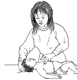
Give 30 chest pushes.

If breath does not go in reopen airway try to breathe again.