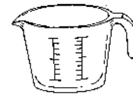
4. Measure the water first

3. Let the nipples, bottles, caps, measuring cups, and spoons air dry.